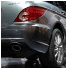
Monitoring of exhaust

The CLD 811 nitrogen oxide analyzer is unique in its performance with a colorful touch screen display enabling easy and flexible operation. It allows the simultaneous measurement of NO, NO 2 and NO x concentrations in raw exhaust of several thousand ppm down to a ppb!