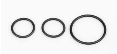
DO-TVS O-rings Kit